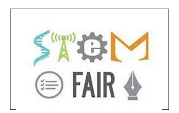
April 8 STEM Fair at Gretna Green