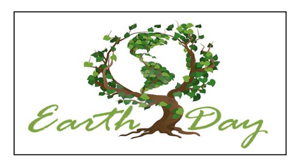
April 22 Earth / Science Day (More details to follow once they are finalized)