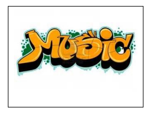
April 13-17<sup>th</sup> Music Festival