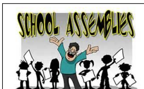
April 29 th School Assembly at 1:00