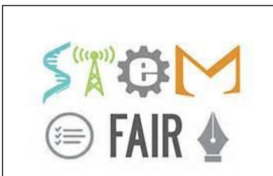
April 14 STEM Fair at Nelson