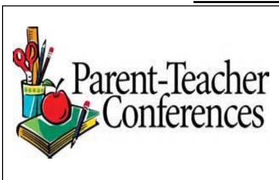
April 1 Parent Teacher (No School)