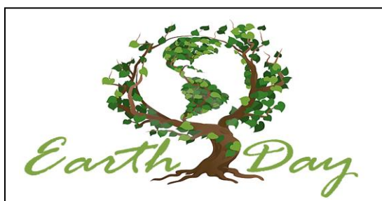
April 22 Earth / Science Day (More details to follow once they are finalized)