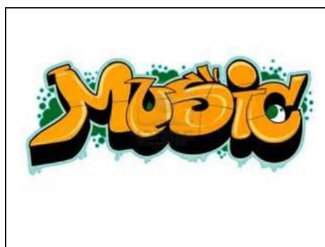
April 26 @ 9:15am Music Festival at Carrefour